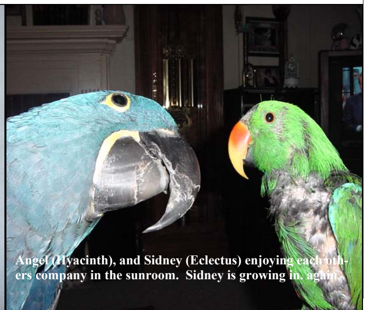
Angel (Hyacinth), and Sidney (Eclectus) enjoying each others company in the sunroom. Sidney is growing in again.